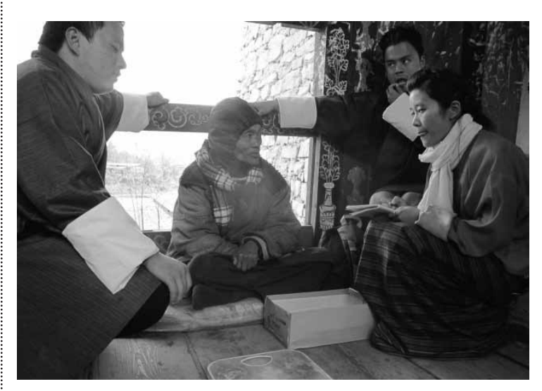
Students interview a man (second from left) during National Day for a citizen journalism project.

Speaking at the closing ceremony of the workshop, Dasho Neten Zam of the Anticorruption Commission repeated the slogan: "We care and we dare!"