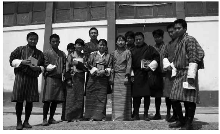
The SMS team takes time for a picture during a break at the workshop at Jigme Sherubling High School.