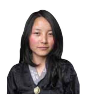
"To be able to enjoy all the rights and privileges that the country has to offer, without being subjected to discrimination based on gender, race, ethnicity and other statuses."