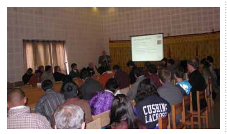
A half-day forum held at Tarayana to examine the idea of a "Culture of Democracy" and what it means to Bhutan.