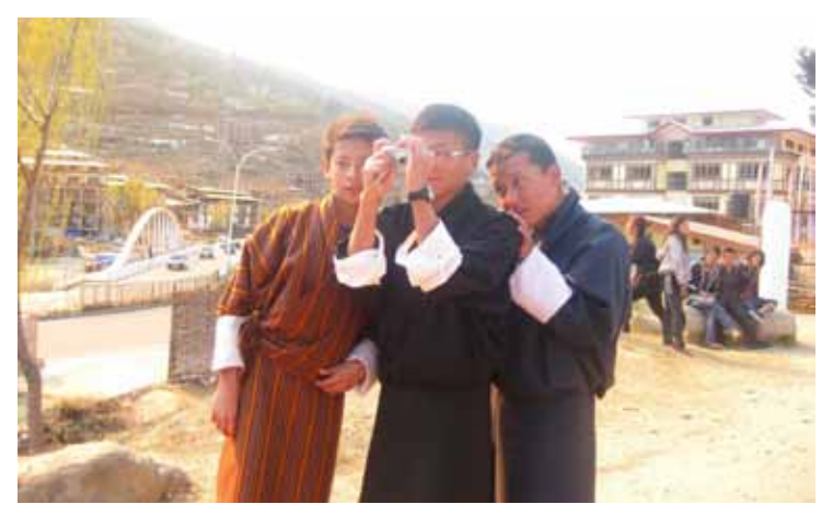
Participants from Loselling & Changzamtog School taking pictures of "Something I like".

BCMD and Photokidz Club from Thimphu's Youth Centre held a joint training in photography recently.