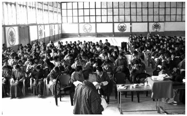
Members of SMS present on the different forms and the core concept of media