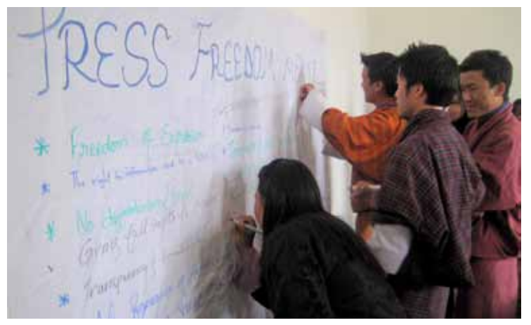
Youth expressing their understanding of what Press Freedom means on a piece of canvas.

On the occasion of Press Freedom Day, BCMD hosted a half-day forum on the topic: Difficulty in the Access to Quality Information Undermines Press Freedom . In attendance were 143 students from Paro College of Education, Yangchenphug High School, Royal Thimphu College, Royal Institute of Management, and the Royal Institute of Health Sciences, as well as teachers and observers from various organizations. At the forum, students engaged with members of the media fraternity in a conversation on the Right to Information Act (RTI) and its implication for journalists, ethical issues in reporting, and the "culture of secrecy" that inhibits data collection.