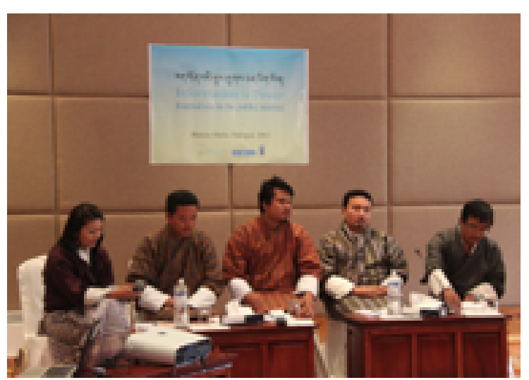
Journalists share their stories at the annual Dialogue