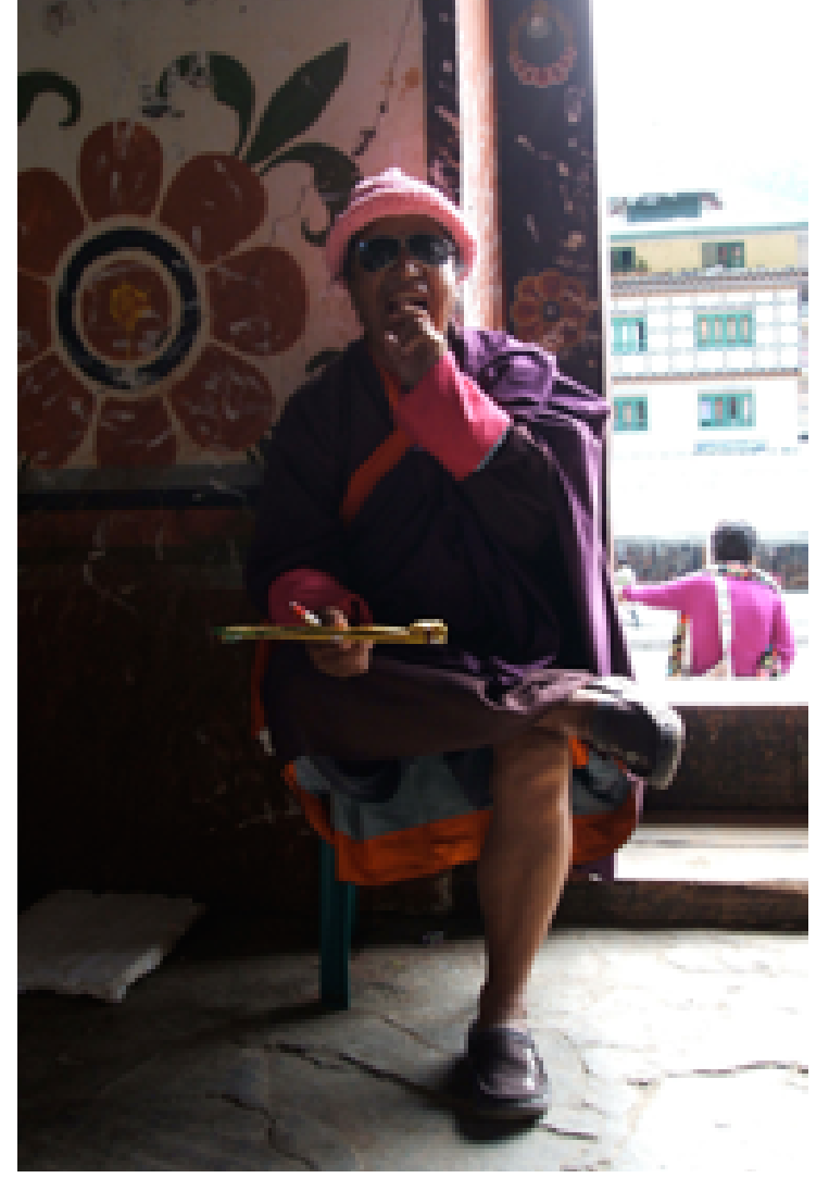
Old monk resting by the Thimphu Centennial Market bridge

Bhutanese and Singapore youth learn to focus on Bhutan through photography