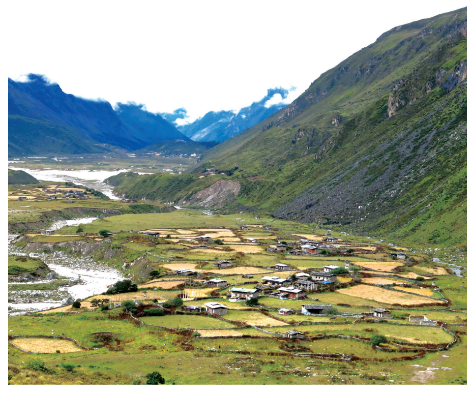
Thangza village in Lunana which is threatened by a glacial lake outbrust flood. BCMD's Journalism Fellowship last year took a reporter beyond this village to cover rural stories.

The Parliament's initiative for the youth is closely related to the concept » on page 2