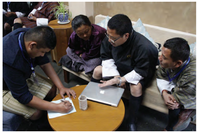
Journalists work together in the annual Media Dialogue