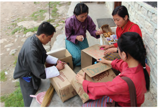
Mapping the community in Paro