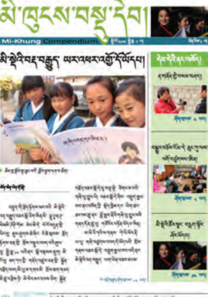
4 mediums: newsletter, bookmark, academic journal & radio transcript