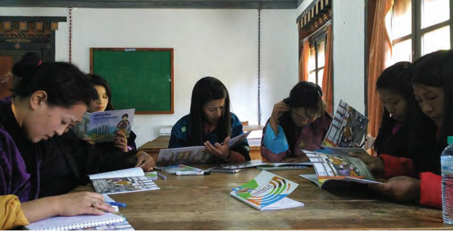
Instructors of Early Child Care Development and Non Formal Education use BCMD's children's book for story telling sessions and to lead discussions with their students

Throughout Bhutan, few materials exist that are devoted to the topic of democracy and citizen action. Schools, libraries, and even the public domain rarely offer resources that allow citizens to comprehend what democracy entails. Moreover, the limited resources that do exist tend to target the elite, leaving most segments of society with little recourse to learn more about democracy.