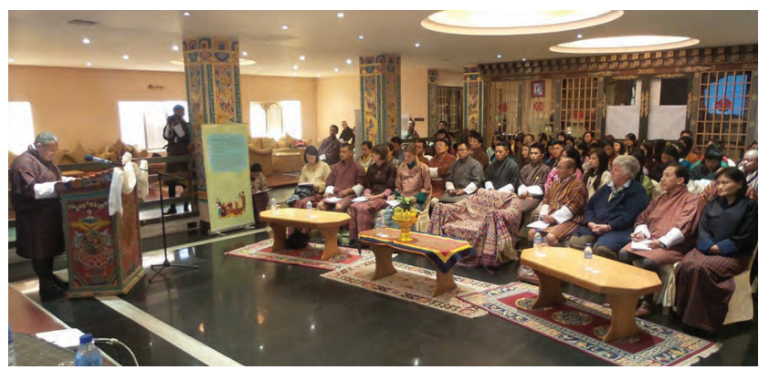
Former Chief Justice H.E Lyonpo Sonam Tobgye traces the development of democracy during the human rights day forum