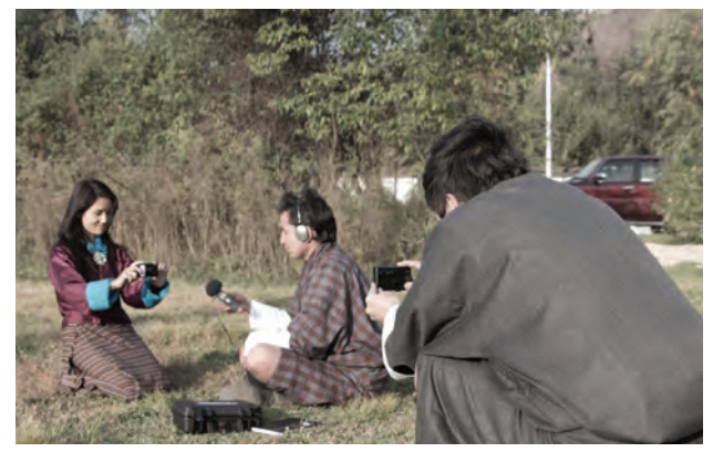
Participants at the multimedia training in Paro