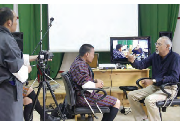
BCMD teaches youth and teachers to create multimedia stories