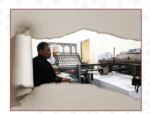
The Druk Journal in print in a local printing house.

The centre also produced a compendium on articles from K2 on Kuensel that featured works of over 48 civil society organisations (CSOs) to advocate about the landmarks, opportunities, and challenges faced by the civil society fraternity. To educate people on democratic values, BCMD produced eight public service announcements on democratic values such as mutual respect, equity, accountability, and civic engagement.