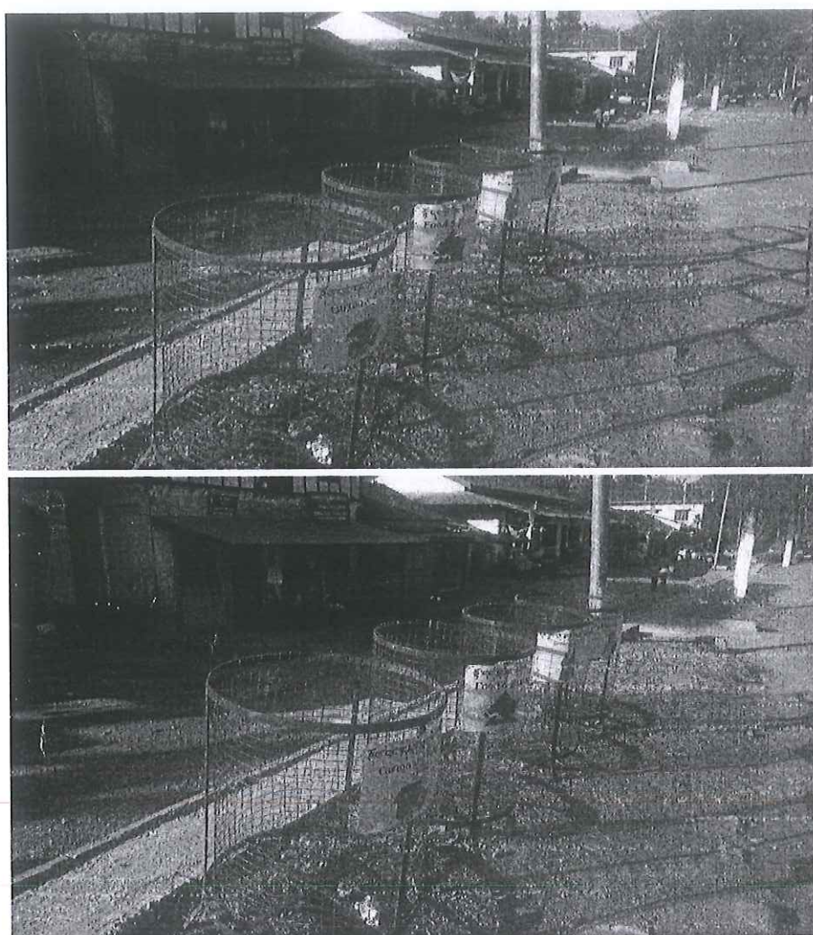
Dustbins installed in Dewathang Town

The dustbins were given to Tshoki Gyatsho Institute for painting and welding. It was collected from there on 26 th November. The 23 dustbins were installed in Dewathang town and in some areas where there was need on 4 th December.