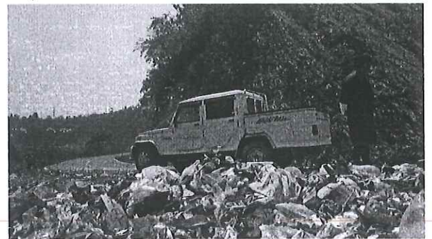
Picture showing waste dumped at an open fill