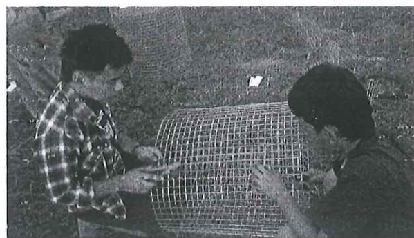
Volunteers making the dustbins