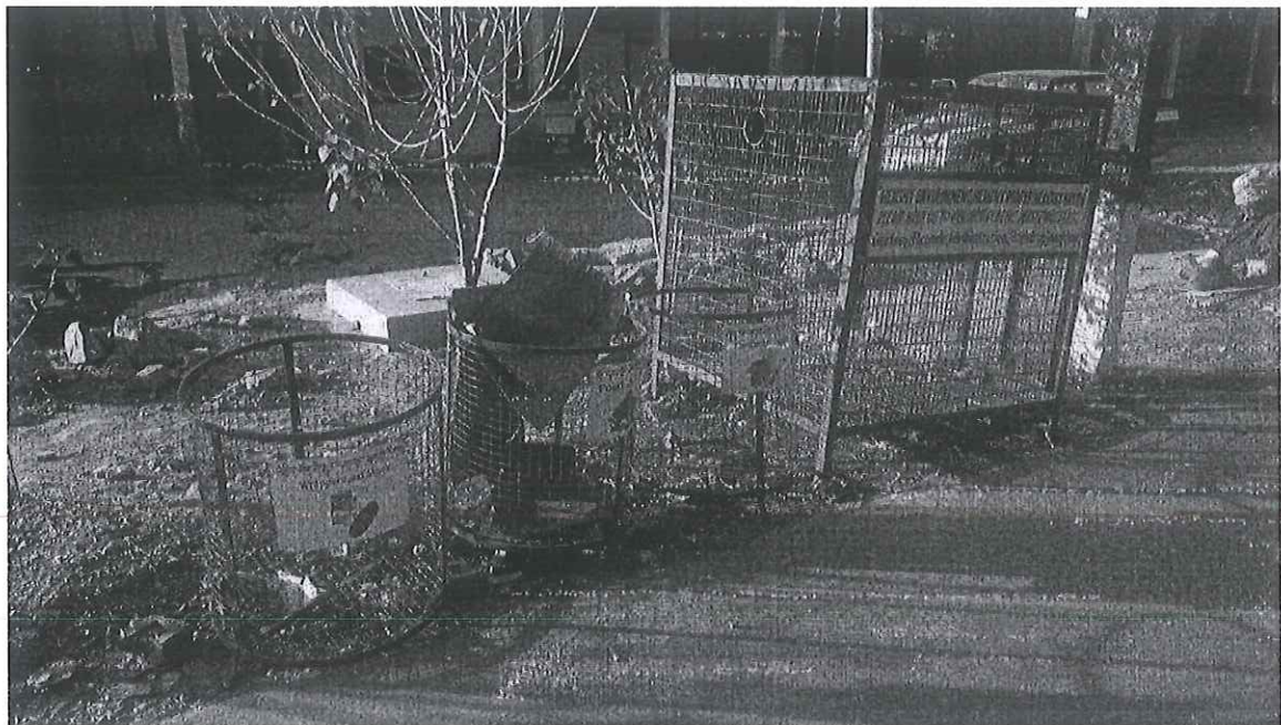
Our dustbins installed beside a dustbin already installed by Thromde

What is meant by institutions brought together? Democracy Day Challenge fund was a little not enough. And so we had to approach Samdrup Jongkhar Initiative. As requested we received Nu 7000.00 (seven thousand only) from SJI and then later we found that we were still in short. Therefore, we had to approach the Dewathang town Committee. The committee also kindly supported the project with Nu 2500.00 (two thousand five hundred only). Only with all these institutions supporting the project was implemented very successfully.